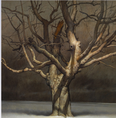
The Dark Line , John Jude Palencar Gold Medal of Honor

Each year the Society holds its Annual International Exhibition , a juried exhibition of watercolors from artists around the world. More than 1,100 artists from the U.S. and 32 foreign countries submit their work. This year, 143 paintings were selected for the exhibition and 40 paintings were selected to travel to museums across the country.