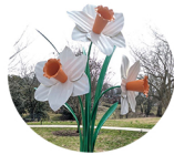
4. Cliffhanger Jeff Fetty Forged Steel, 2019