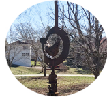
6. Rooster Artist Unknown Steel, Date Unknown