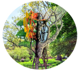
1. Four Seasons Ed Dolinger Mild Steel, 2017

207 Starling Ave • Open daily from dawn to dusk • Admission Free