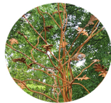
5. Giving Tree Jeremy Stollings Steel, 2019